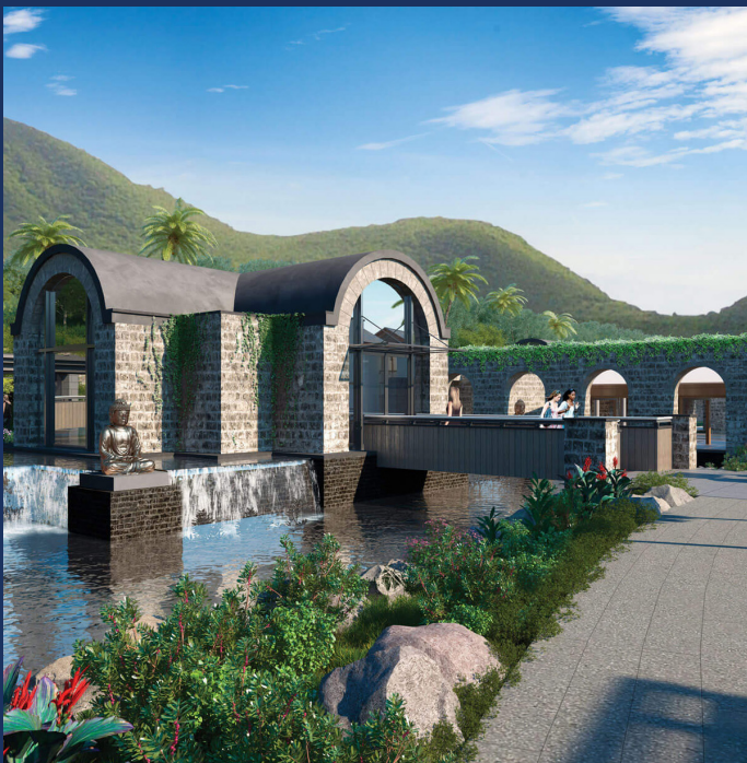
Park Hyatt St. Kitts