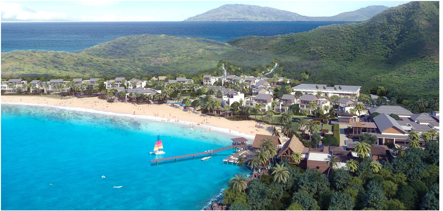
Park Hyatt St. Kitts